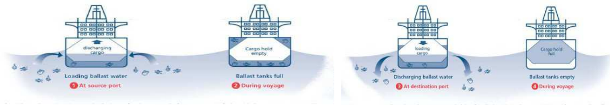
Figure 1: Cross Section of Ships Showing Ballast Tanks and Ballast Water Cycles

Ballast tank arrangements on board in different types of vessels are to meet the requirements of ballast water on board. The figures below give the structural arrangements and ballast capacities on different classes of vessel. (Tzankova, 2001)